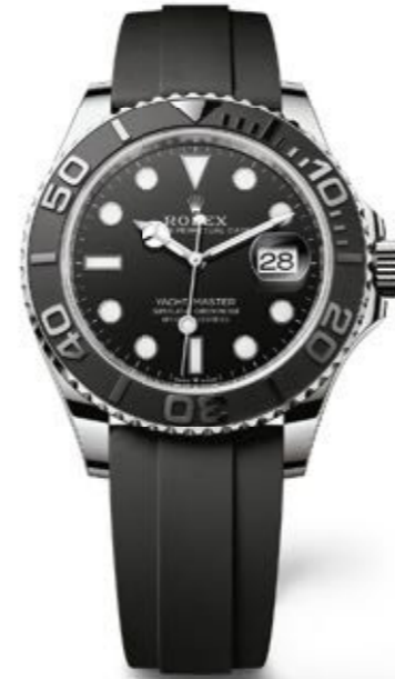
OYSTER PERPETUAL YACHT-MASTER 42 IN 18 CT WHITE GOLD